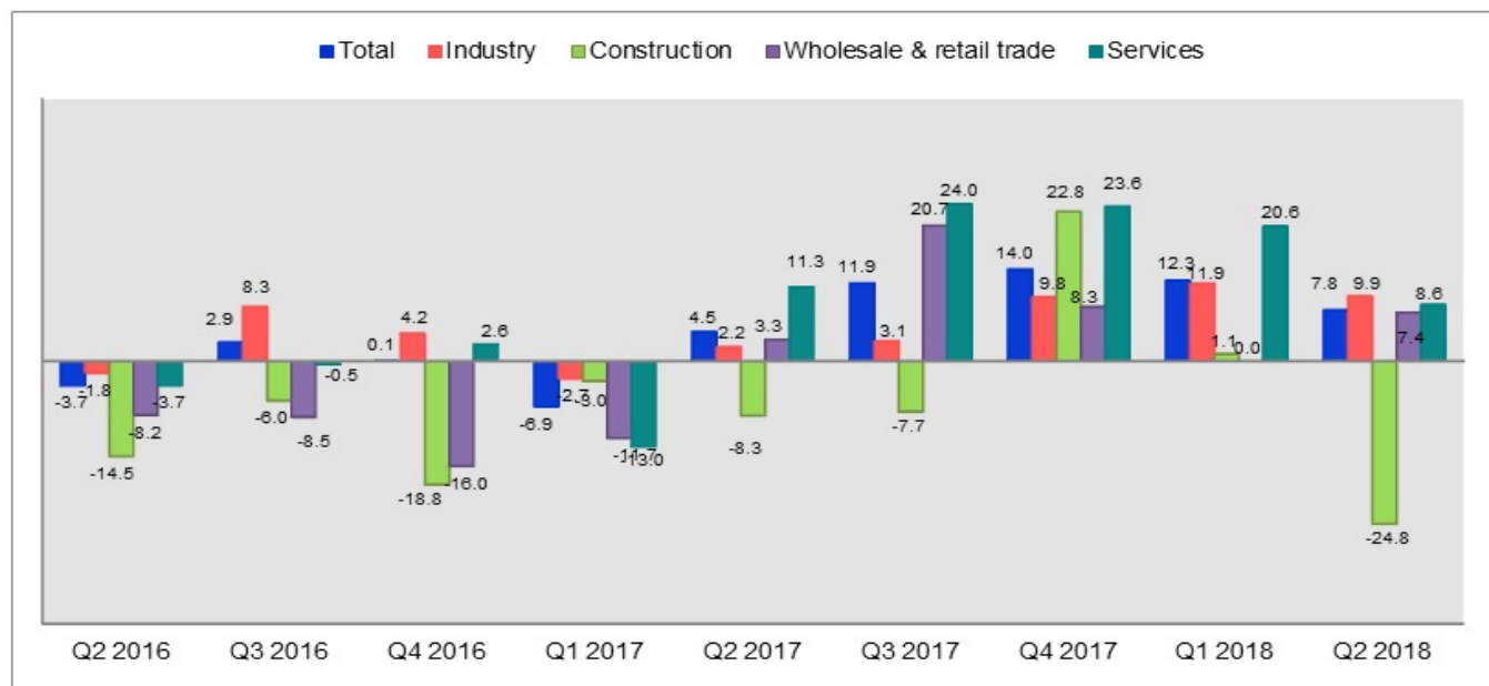
Chart I: Quarterly Confidence Indicator by Sectors, Malaysia, 2016-2018

The business performance in the second quarter of 2018 is expected to continue increasing with confidence indicator +7.8 per cent, mainly in industry (+9.9%), wholesale & retail trade (+7.4%) and services (+8.6%) sectors.