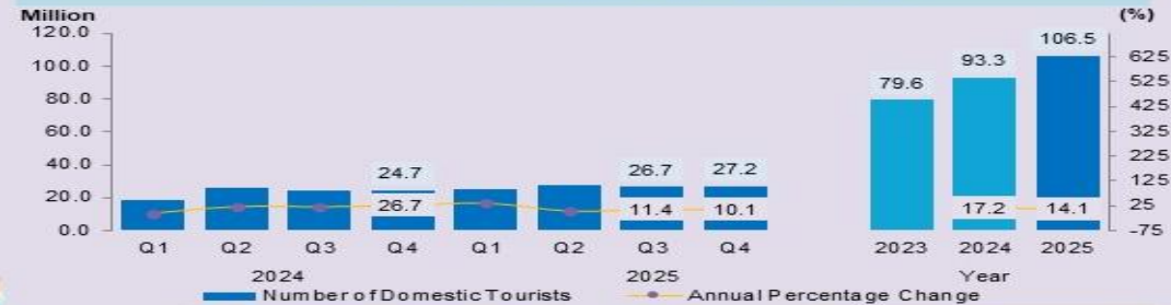
Performance of Domestic Tourists, 2023-2025