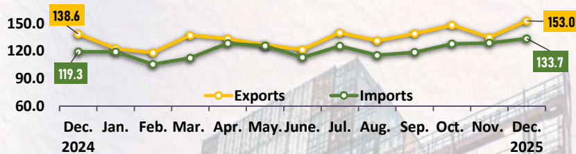
Malaysia External Trade Statistics December 2024 – December 2025 (RM billion)