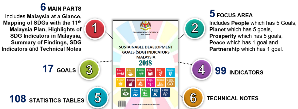
Exhibit 1: Brief content on the report of Sustainable Development Goals (SDG) Indicators, Malaysia, 2018

A total of 108 tables encompassing 99 indicators under 17 goals have been compiled as important references for government, private sectors, academicians, Non-Government Organisations (NGOs), Civil Society Organisation (CSO) and individuals. The indicators can be used as an input for research, policy formulation as well as monitoring and evaluating the effectiveness of the national development programmes.