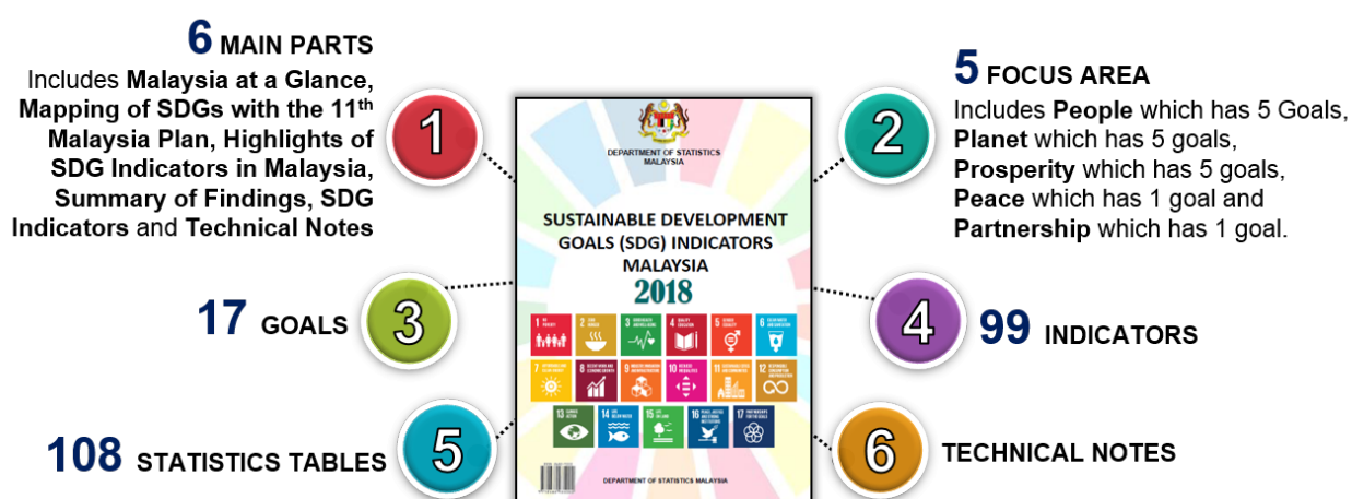
Exhibit 1: Brief content on the report of Sustainable Development Goals (SDG) Indicators, Malaysia, 2018

A total of 108 tables encompassing 99 indicators under 17 goals have been compiled as important references for government, private sectors, academicians, Non-Government Organisations (NGOs), Civil Society Organisation (CSO) and individuals. The indicators can be used as an input for research, policy formulation as well as monitoring and evaluating the effectiveness of the national development programmes.