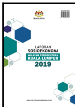
WP Kuala Lumpur