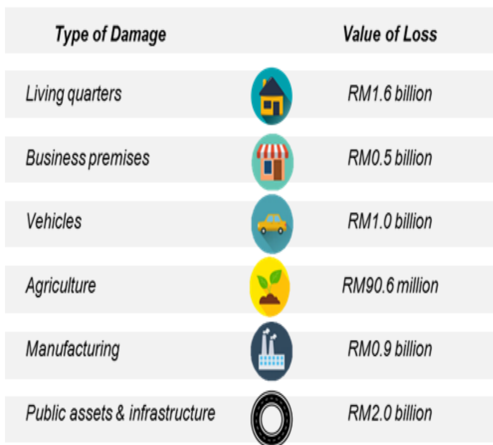
Exhibit 1: Value of Flood Losses by Type of Damage

Overall losses due to the floods recorded RM6.1 billion which equivalent 0.40 per cent as against nominal Gross Domestic Product. Living quarters losses were RM1.6 billion, business premises RM0.5 billion, vehicles RM1.0 billion, agriculture RM90.6 million, manufacturing RM0.9 billion and public assets & infrastructure RM2.0 billion as shown in Exhibit 1.