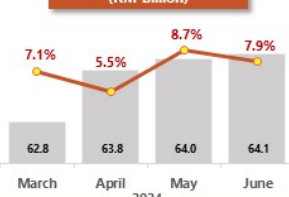
Sales Value of Retail Trade (RM billion)