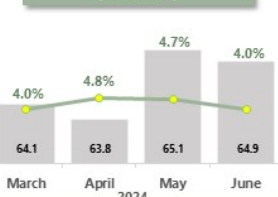
Sales Value of Wholesale Trade (RM billion)