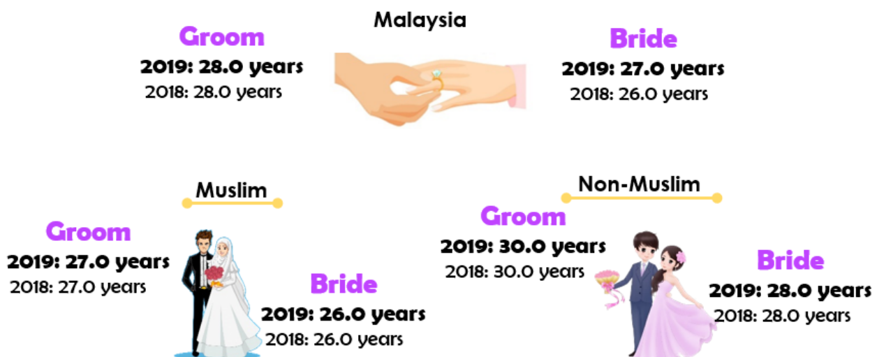
Exhibit 1: Median age at marriage by sex, Malaysia, 2018 and 2019

The median age of grooms remained at aged 28.0. Meanwhile, the median age for brides increased from 26.0 years to 27.0 years. The median age of grooms and brides for Muslim and Non-Muslim remained unchanged.