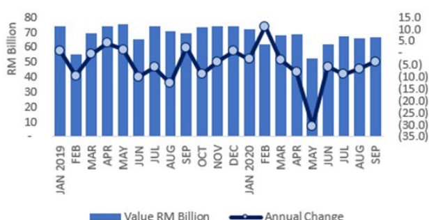
Chart 2: Imports, Value (RM Billion) and Annual Change (%)