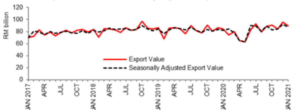
Chart 2: Export Value and Seasonally Adjusted Export Value, RM billion