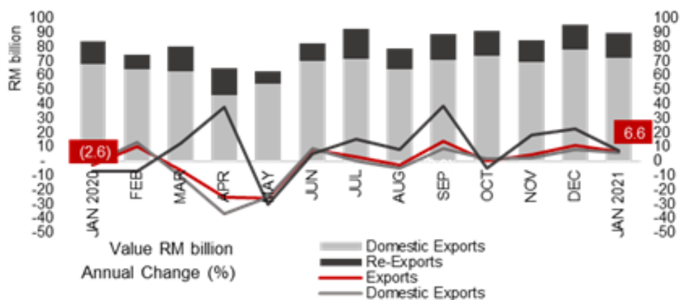
Chart 1: Domestic Exports, Re-Exports (RM billion) and Annual Change (%)

Malaysia's exports continued its positive momentum in January 2021, expanding by 6.6 per cent from RM84.1 billion in January 2020 to RM89.6 billion. The expansion was driven by both domestic exports and re-exports. Domestic exports stood at RM72.1 billion contributed 80.5 per cent to the total exports, grew by 6.3 per cent. While, the re-exports which was value at RM17.5 billion, went up by 7.5 per cent y-o-y. In comparison to December 2020, exports declined by 6.4 per cent or RM6.1 billion. Analysis of the seasonally adjusted terms m-o-m, exports decreased by 5.6 per cent to RM5.2 billion.