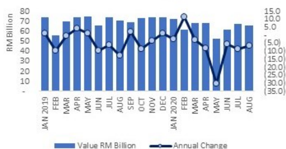
Chart 2: Imports, Value (RM Billion) and Annual Change (%)