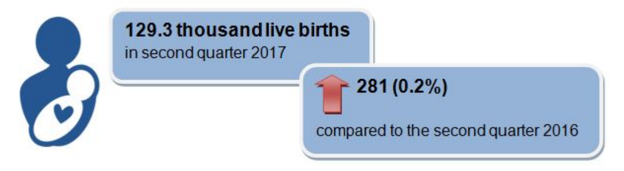
[Table 1] Number of live births and percentage change