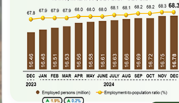
THE NUMBER OF EMPLOYED PERSONS AND EMPLOYMENT-TO-POPULATION RATIO, MALAYSIA, DEC 2023 - DEC 2024