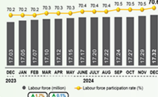
LABOUR FORCE AND LABOUR FORCE PARTICIPATION RATE (LFPR), MALAYSIA, DEC 2023 - DEC 2024

70.6% The labour force participation rate during the month edged up by 0.1 percentage points to 70.6 per cent