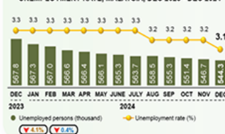
THE NUMBER OF UNEMPLOYED PERSONS AND UNEMPLOYMENT RATE, MALAYSIA, DEC 2023 - DEC 2024

3.1% December's unemployment rate decreased to 3.1 per cent