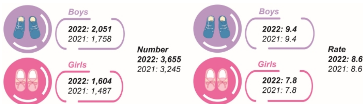
Exhibit 2: Under-5 mortality (number and rate), Malaysia, 2021 and 2022

Malaysia has achieved the target for Indicator 3.2.1: Under-5 mortality rate since 1984 (22.8). The mortality rate of children under-5 for 2022 remained unchanged at 8.6 per 1,000 live births in 2021 and 2022. The mortality rate for boys and girls in 2022 also remained unchanged at the same figures from 2021 which are 9.4 and 7.8 per 1,000 live births respectively.