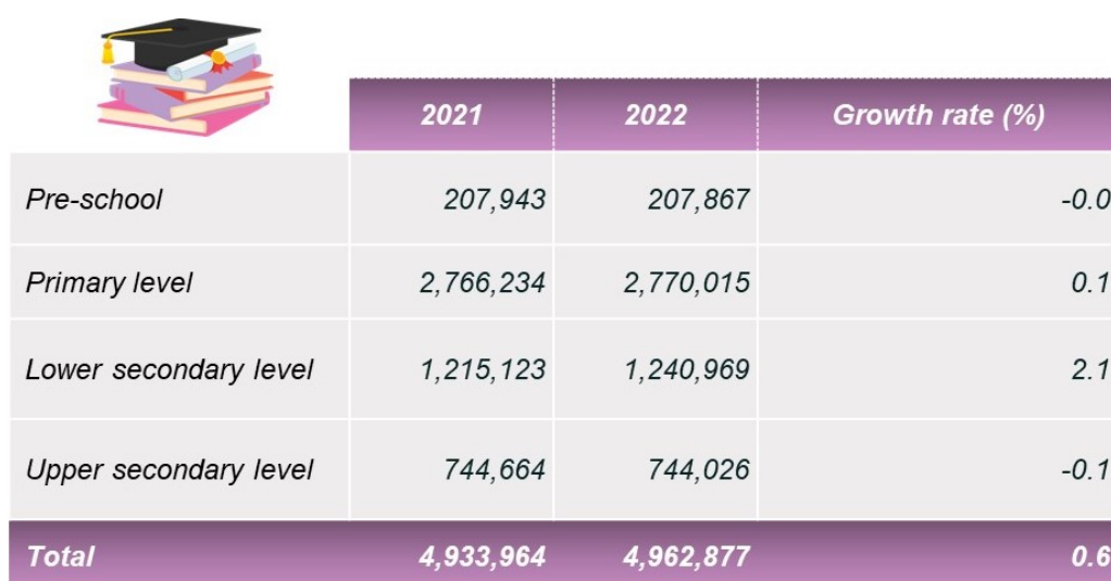
Table 3: Number of pupils in government and government-aided schools by level of education, Malaysia, 2021 and 2022

The number of pupils in government and government-aided schools in 2022 were 4,962.9 thousand, increased by 0.6 per cent from 4,934.0 thousand in 2021. This increase is mainly due to an increase of 25.8 thousand pupils (2.1%) at the lower secondary level as compared to the previous year. At the same time, primary level enrolment increased by 3.8 thousand to 2,770.0 thousand as compared to 2,766.2 thousand in 2021.