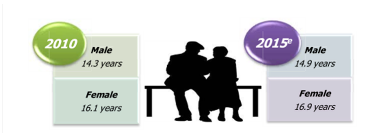
Figure 2: Life Expectancy at 65 years, Malaysia, 2010 and 2015 e

The difference in life expectancy between sexes in 2015 was 2.0 years as compared to 2010 by 1.8 years.