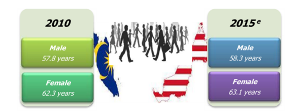
Figure 1: Life expectancy at 15 years, Malaysia, 2010 and 2015 e

In overall, the difference in life expectancy at 15 years between males and females was 4.8 years in 2015.