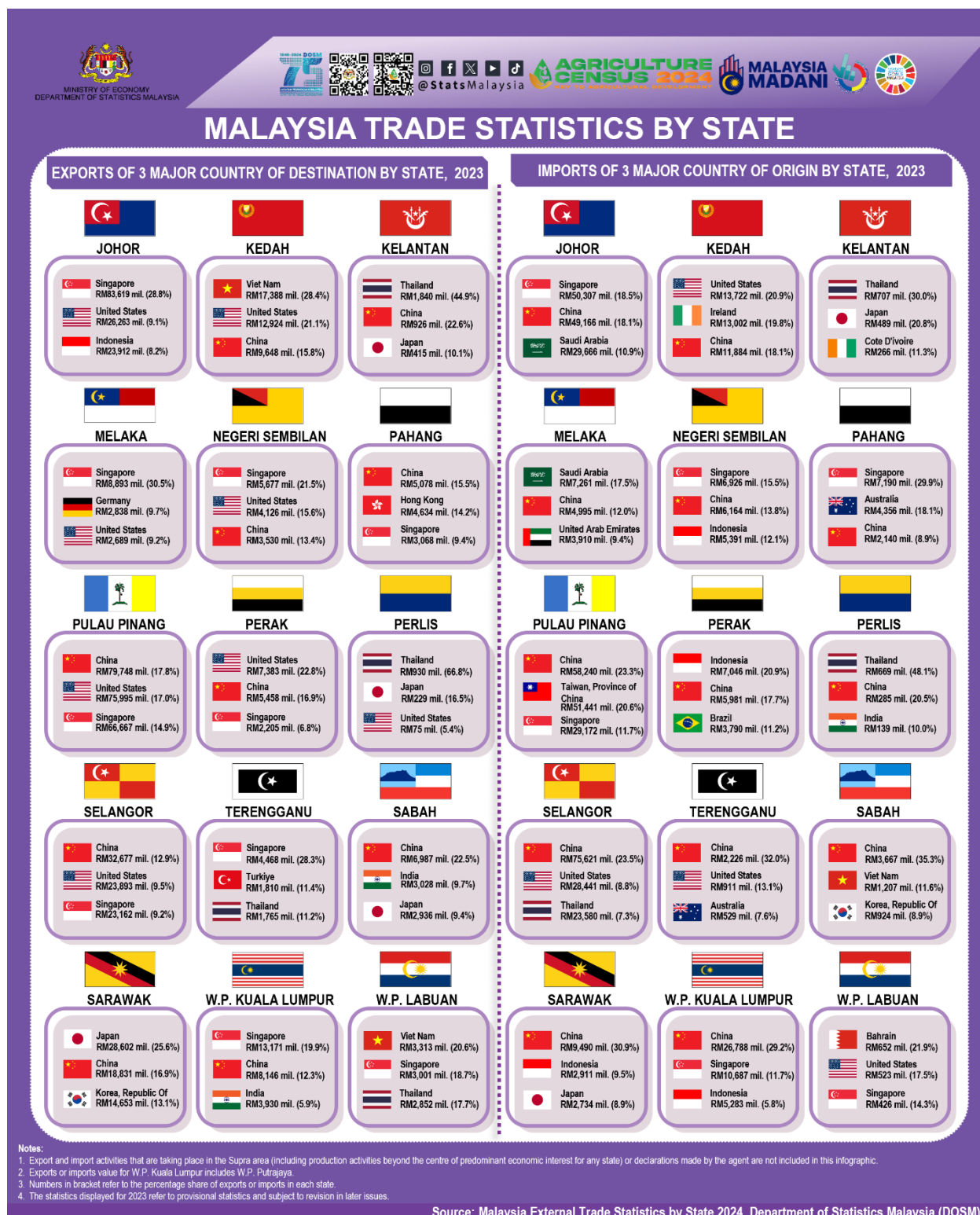
Exhibit 3: Top 3 Export Destinations and Import Sources by State, 2023