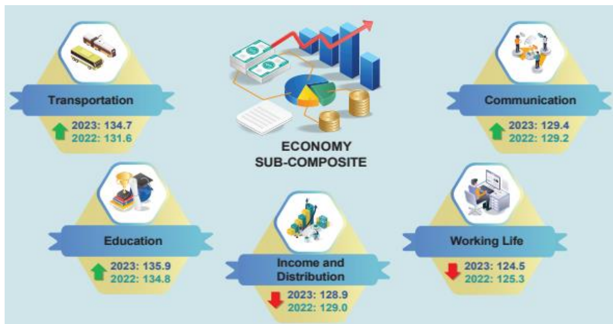
Exhibit 2: Malaysian Well-being Index for Economic Sub-Composite by Component, 2022 and 2023