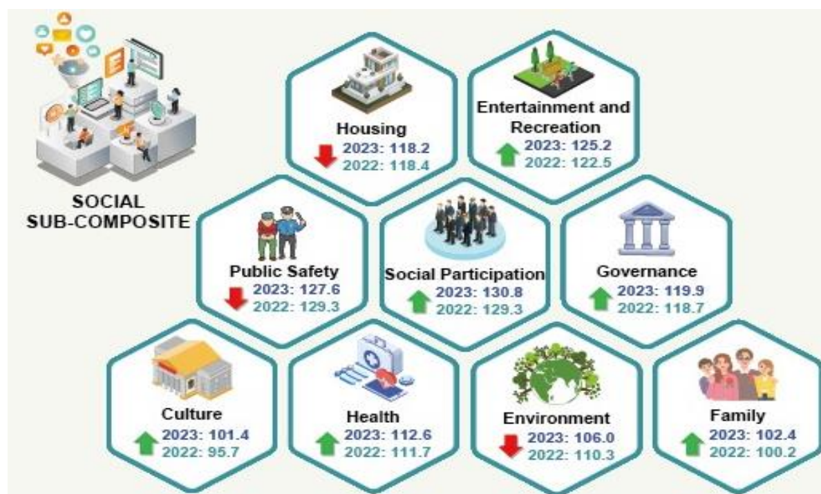
Exhibit 3: Malaysian Well-being Index for Social Sub-Composite by Component, 2022 and 2023