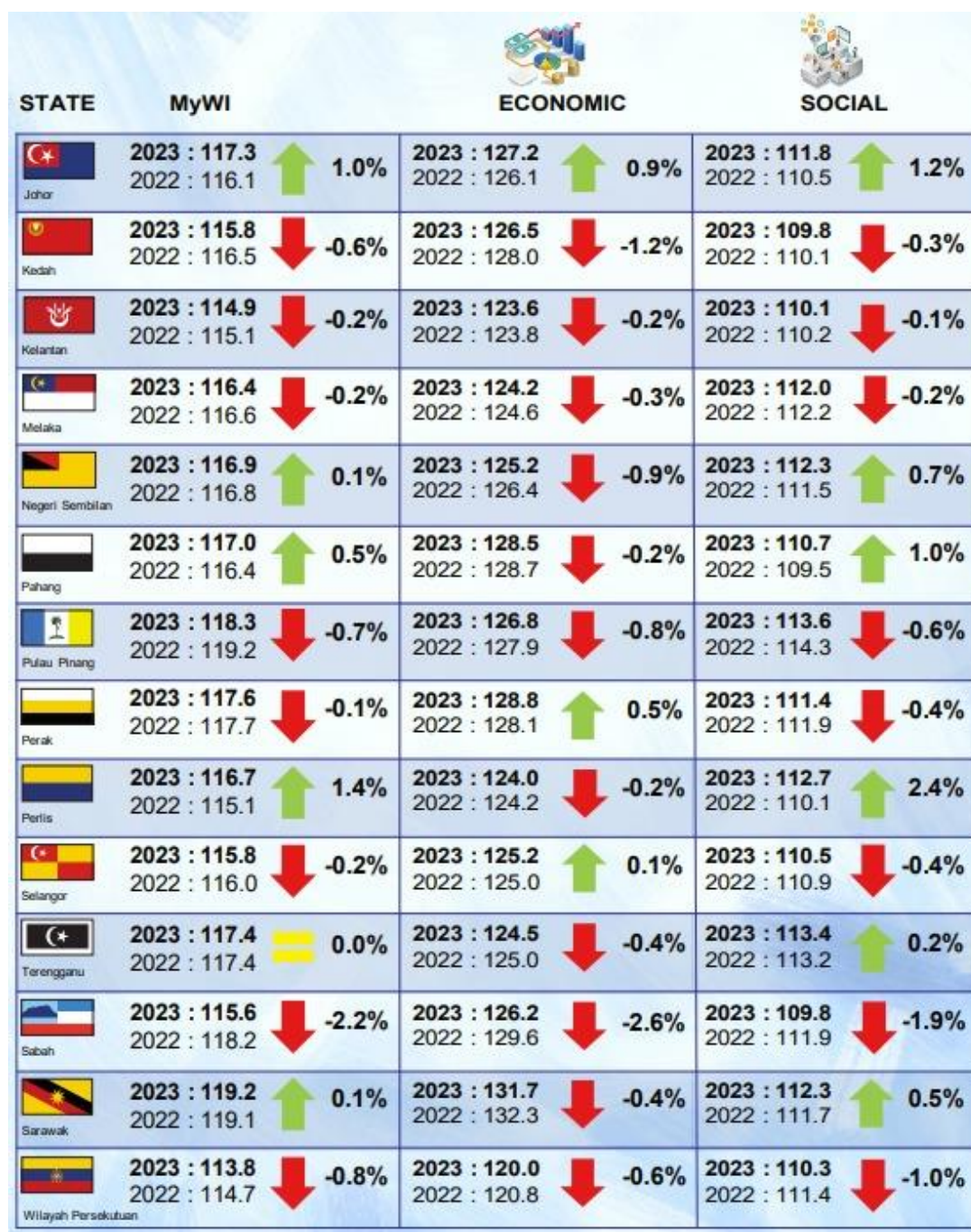
Exhibit 4: Malaysian Well-Being Index at State Level, 2022 and 2023

Note: MyWI at the State Level Base Year (2010=100)