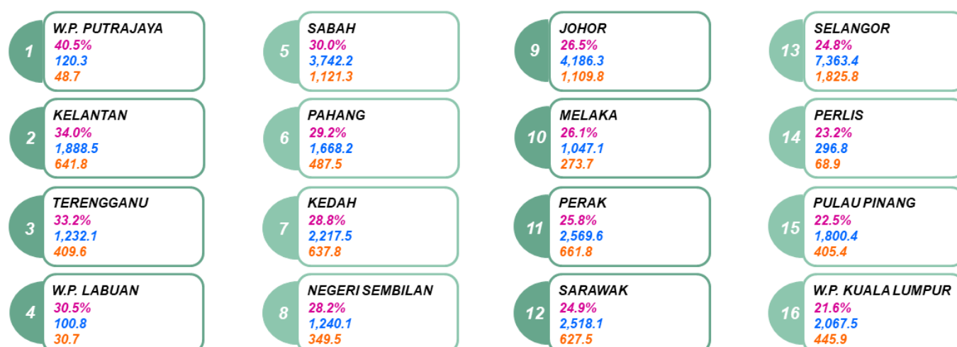
Exhibit 1: Children (0 to <18 years) by state Malaysia, 2024 P

Percentage of children Number of population ('000) Number of children ('000)