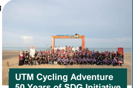
UTM Cycling Adventure 50 Years of SDG Initiative

UTM 50 Years Cycling Journey is synonym with Sustainable Development Goal (SDG) which involved SDG 3 - Cycling generates a healthy lifestyle and reduce air pollution where it contributes to improved air quality and road safety when motor transport is replaced by cycling as well as SDG 7 - Cycling improves the efficiency of the transportation system because it uses renewable manpower in the most efficient way for transportation.